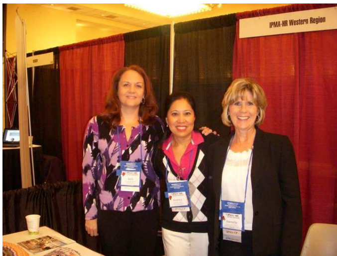
Staffing the 2011 IPMA-WR Conference Table