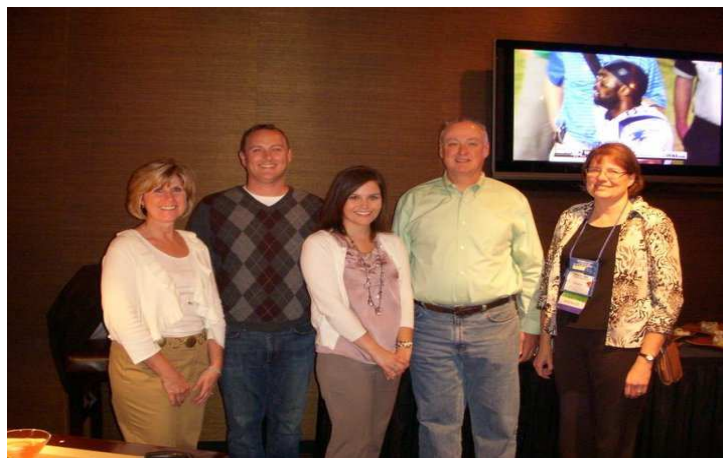
Members of 2011 WRIPMA-HR Conference Planning Team enjoying the Western Region Reception.